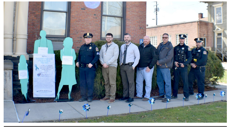
Silhouettes on display at the Norwich City Police Department pictured