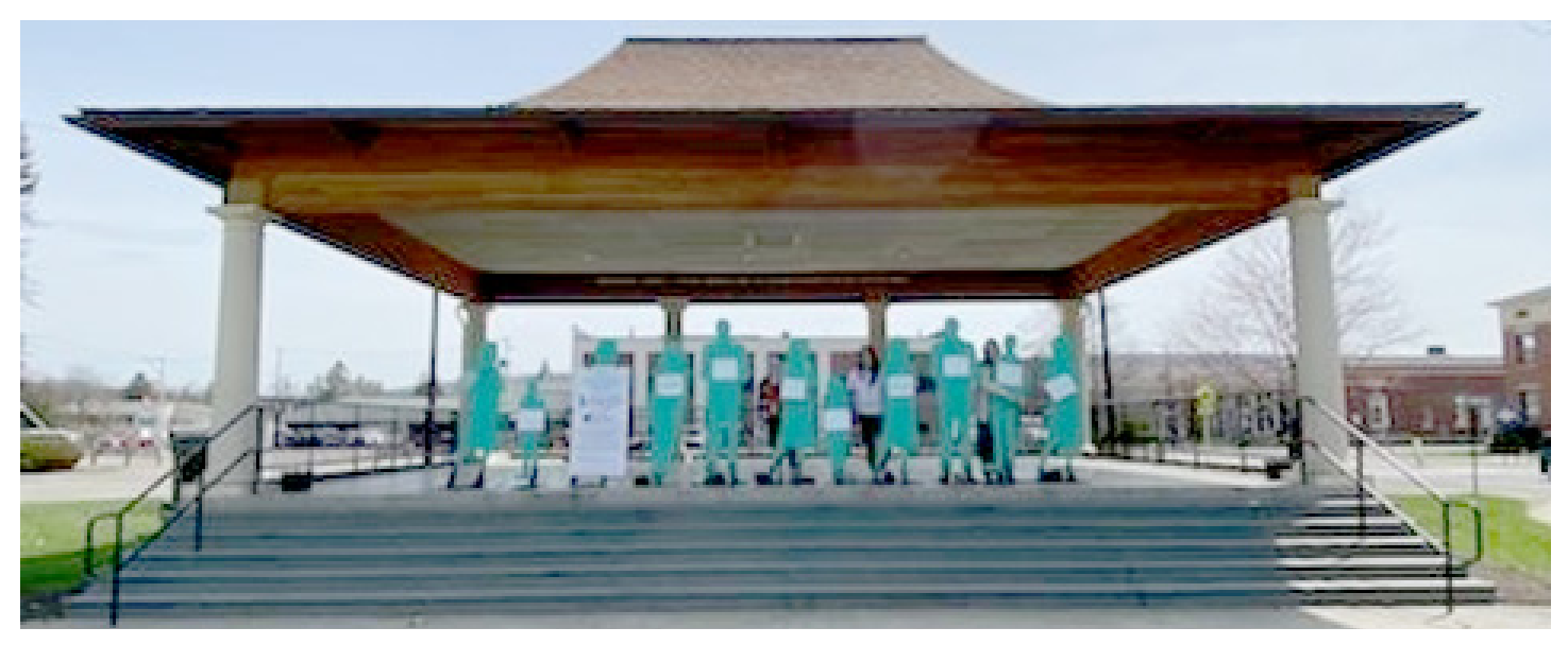
The Silhouettes on display in East side park in the City of Norwich