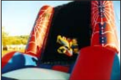
Check Out Toys & Games at the Carnival

Be part of a Magic Show with Sweetheart the Clown