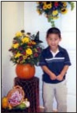
Vote For Your Favorite Floral Design

Be part of a Magic Show with Sweetheart the Clown