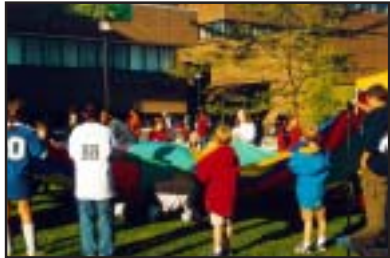
Play Picnic Games