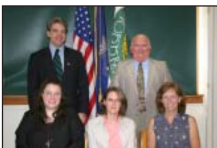
ALUMNI NEWS STAFF

Alumni/Development Office.....101 Bailey Hall Telephone.....1-800-IMA-GRAD Fax.....315-684-6379 E-mail.....alumni@morrisville.edu