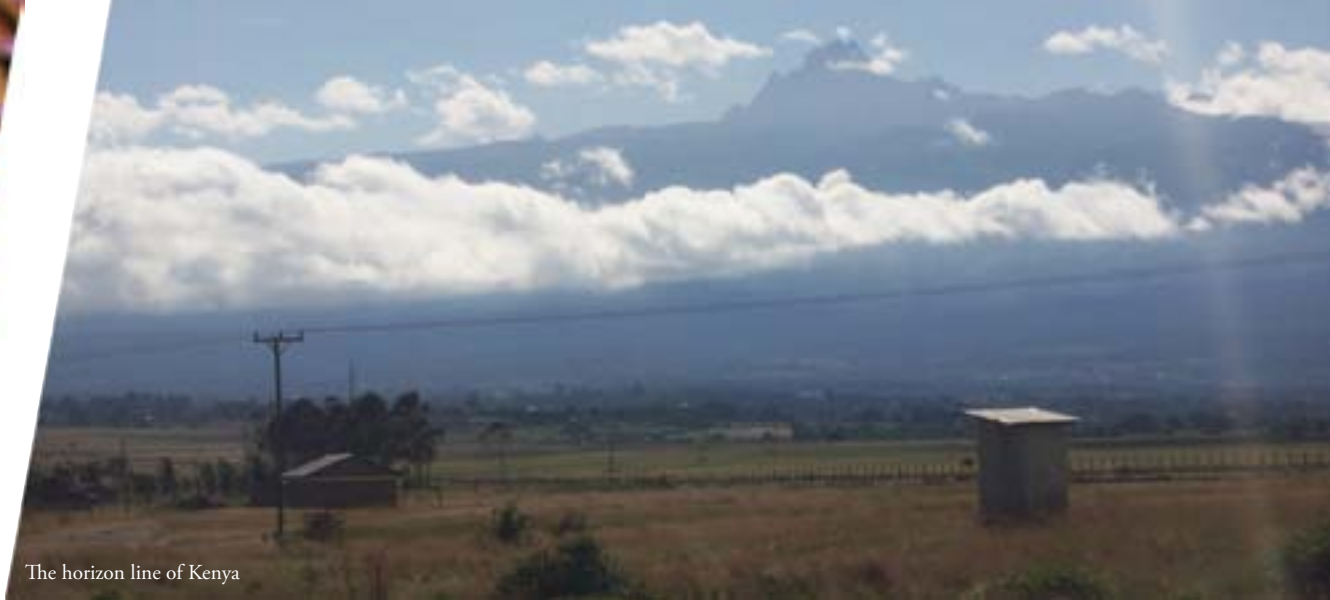
The horizon line of Kenya